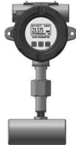
Ex-proof digital display